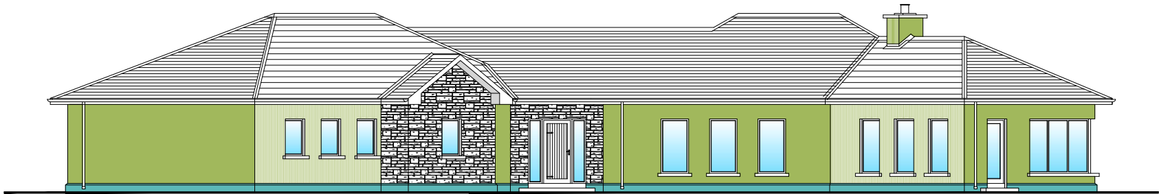
1 100 Front Elevation